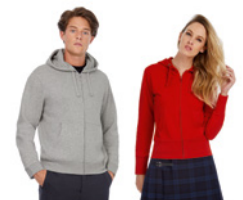
B&C Hooded Full Zip /men & /women