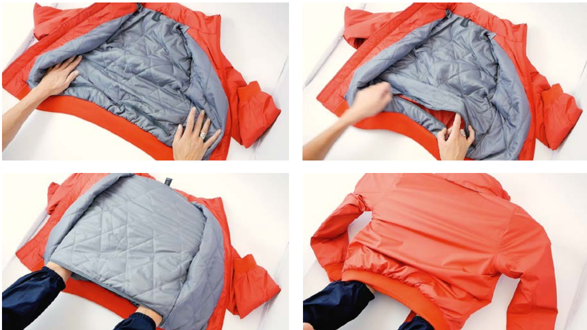
Zip opening at the bottom of the lining.